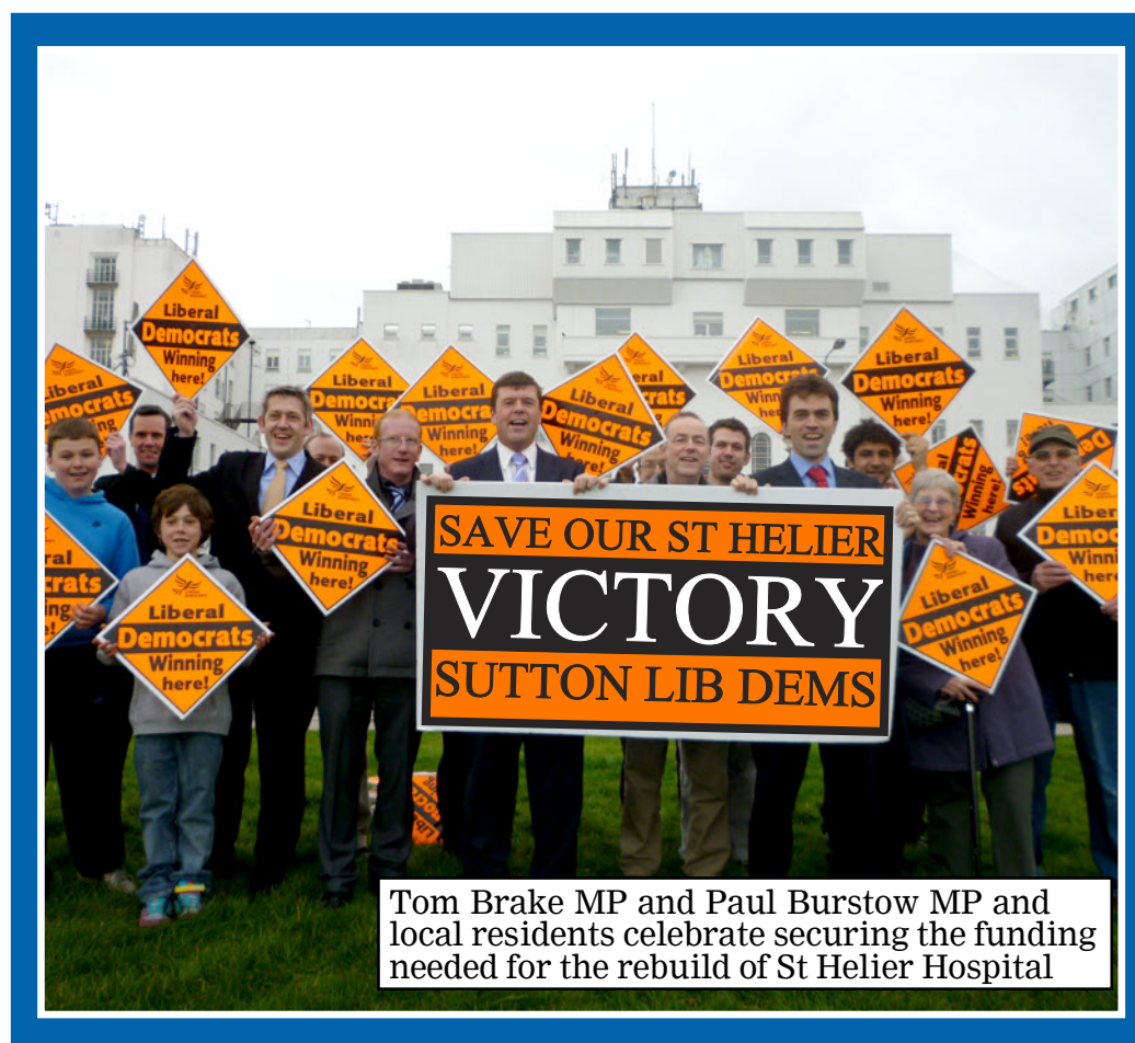
Tom Brake MP and Paul Burstow MP and local residents celebrate securing the funding needed for the rebuild of St Helier Hospital

Now Tom is fighting to ensure that vital services remain at St Helier and is calling for the local NHS to pause, listen and reflect over plans for a headlong merger with St George's Hospital in Tooting.