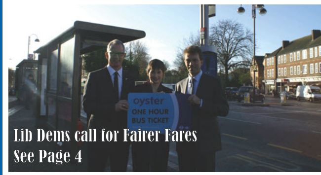
Lib Dems call for Fairer Fares See Page 4

Lib Dems in Government deliver biggest pension increase ever – See Page 2