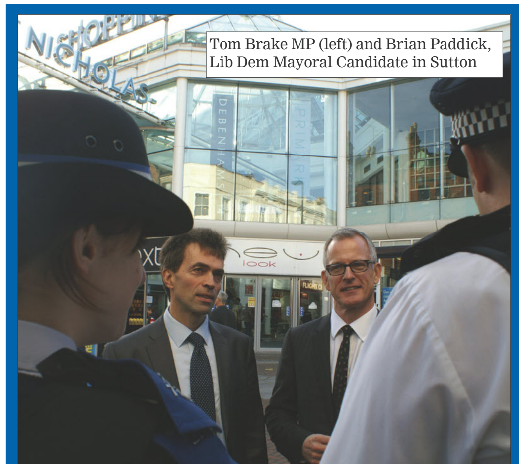
Tom Brake MP (left) and Brian Paddick, Lib Dem Mayoral Candidate in Sutton

Tom Brake MP, the Liberal Democrats and their representatives may contact you from time to time about issues which may be of interest. Some of these contacts may be automated. You can opt out at any time by contacting us.