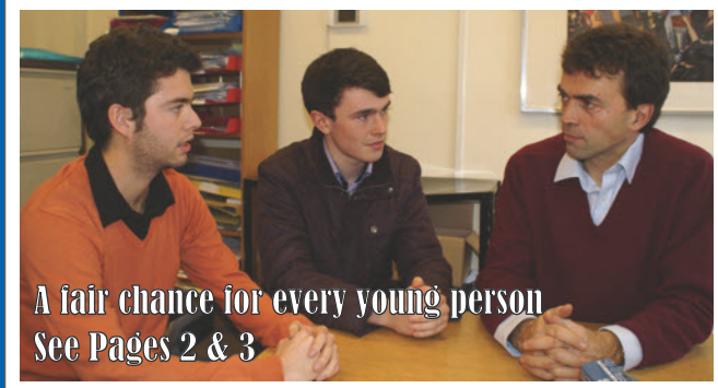
A fair chance for every young person See Pages 2 & 3